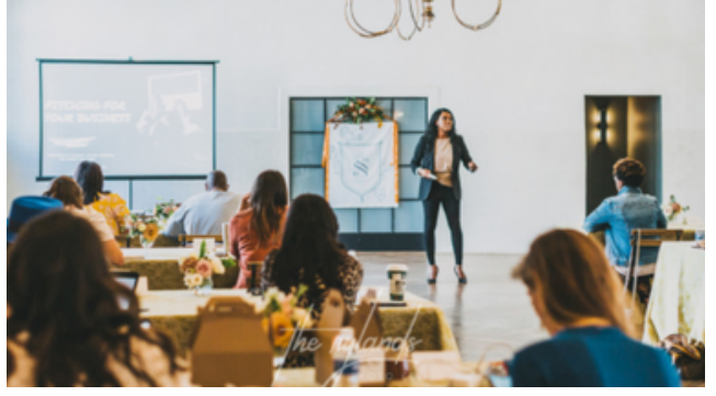
Note: Presentations can be personalized to fit your audience's culture and needs.